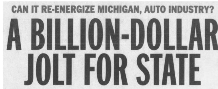
Graphic 3: Front page headline “A billion-dollar jolt for state,” Detroit Free Press, Aug. 6, 2009

“For an economy suffering a multiyear slide, the grants are a key victory,” the article says. It quotes Vice President Joe Biden. “We’re building a new platform for the American economy that will allow us to grow like we did in the ‘40s, ‘50s and ‘60s,” he said. 19