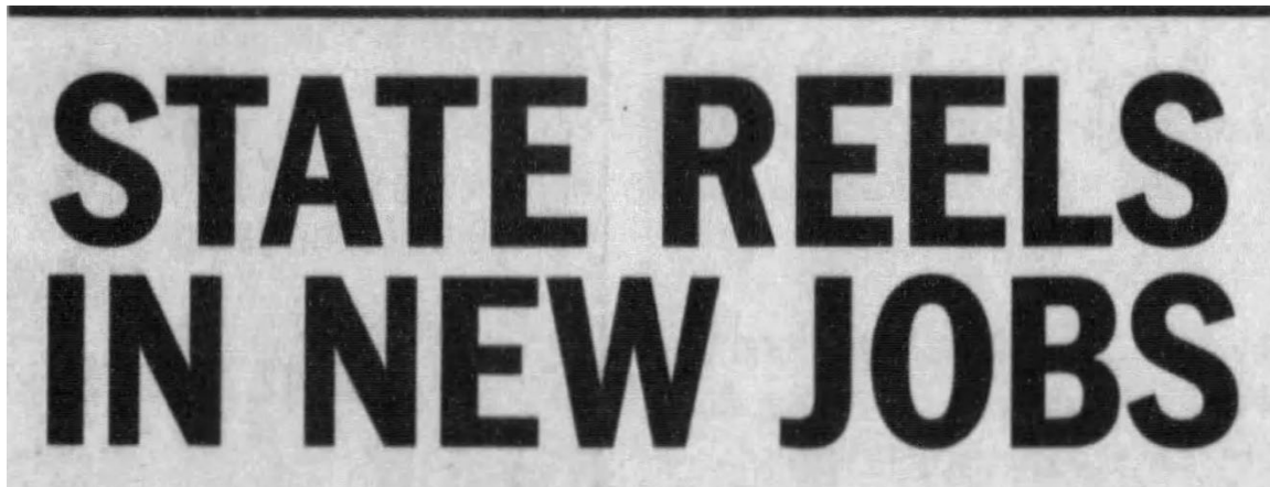
Graphic 1: Front page headline "State reels in new jobs," Detroit Free Press, July 16, 2008

The lede of the story demonstrates the political benefit. It reads, "On a day when Michigan's industrial future took a hit — more job cuts planned for General Motors and no new Volkswagen plant for the state — Gov. Jennifer Granholm's economic team served up 4,800 new, disparate jobs Tuesday to soften the blow." 7