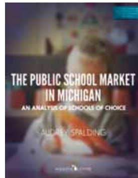
The Public School Market in Michigan — available online at Mackinac.org/s2013-11