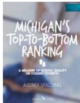
Michigan's Top-to-Bottom Ranking — available online at Mackinac.org/s2013-07

facebook.com flickr.com twitter.com /MackinacCenter youtube.com pinterest.com